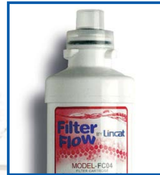
High capacity filter cartridge

The unique predictive eco mode learns from your usage and switches automatically to eco mode during quieter periods. Full operating capacity is restored when demand picks up.