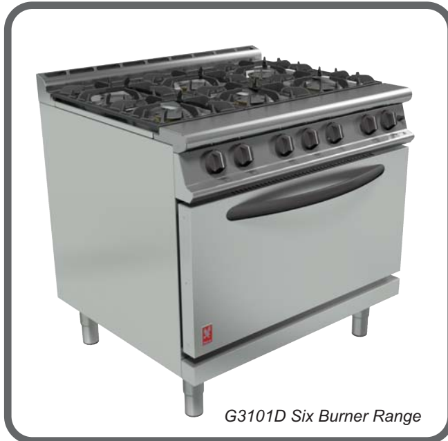
G3101D Six Burner Range