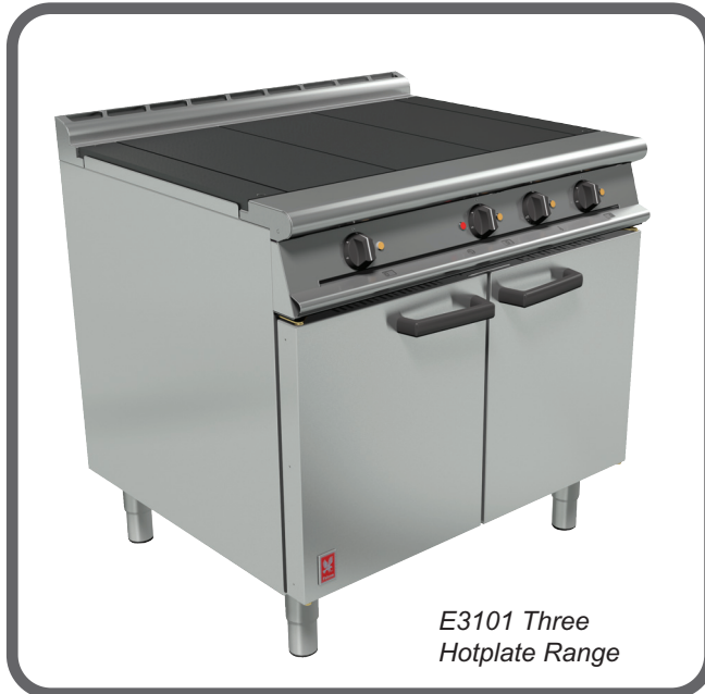
E3101 Three Hotplate Range