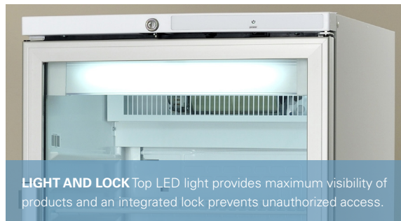
LIGHT AND LOCK Top LED light provides maximum visibility of products and an integrated lock prevents unauthorized access.