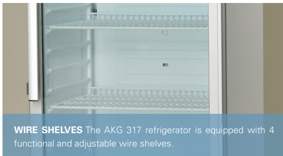
WIRE SHELVES The AKG 317 refrigerator is equipped with 4 functional and adjustable wire shelves.