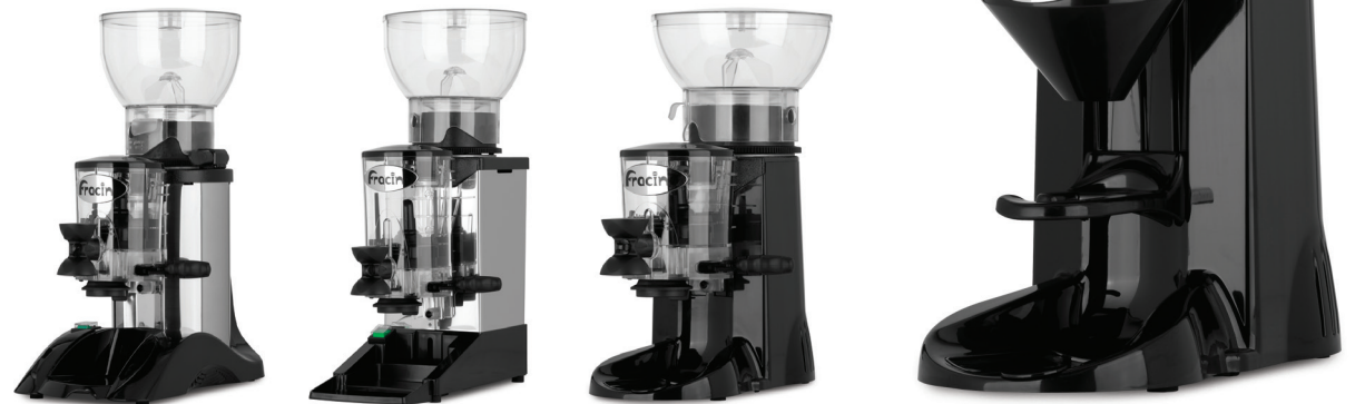
● Model B ● Model T ● Tranquilo Black ● Tranquilo single shot in Black

The models T and B grinders have polished stainless steel cases and are ideally suited to the Fracino range of espresso coffee machines. The models T, B and Tranquilo grinders are operated manually by an on/off switch. All grinders have adjustable grinding blades and coffee portion control. Coffee is dispensed into the filter holders by means of a flick lever mechanism. The Tranquilo grinder is also available in a chrome option and as a single shot grinder for the freshest coffee. A tamper would be required for this option.