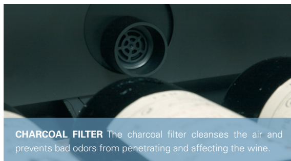
CHARCOAL FILTER The charcoal filter cleanses the air and prevents bad odors from penetrating and affecting the wine.