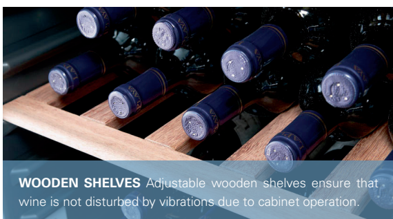
WOODEN SHELVES Adjustable wooden shelves ensure that wine is not disturbed by vibrations due to cabinet operation.