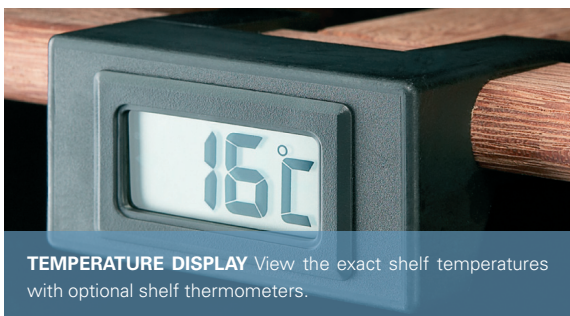
TEMPERATURE DISPLAY View the exact shelf temperatures with optional shelf thermometers.