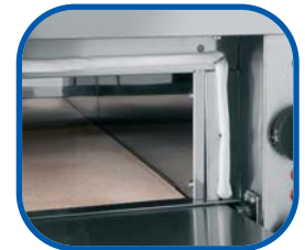
Firebrick base for crisp, even cooking of pizza bases