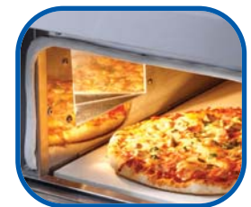
Internal illumination for better visibility of product