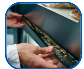
Easy access, removable crumb tray