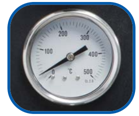
Temperature display gauge

A modern and stylish range of pizza ovens built to the highest specification. All products in the range offer reliability and durability – an essential prerequisite for any busy kitchen! Perfect for deep pan, thin crust, fresh dough, part baked or frozen pizzas, they are also ideal for cooking a variety of other foods such as ciabatta, naan and garlic bread and also lasagne, jacket potatoes, pies, pasties and pastries.