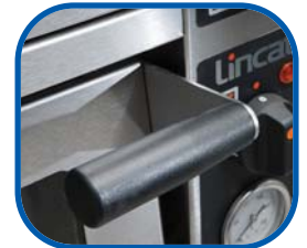
Reversible oven handle for optimum operational comfort