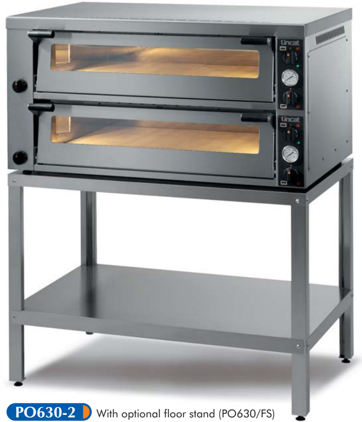
PO630-2 With optional floor stand (PO630/FS)