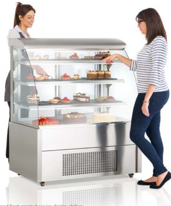
Image (above): FDC1200C Closed front assisted service display chillers

In its closed front format, the Foster Display Chiller provides a stylish solution to the demands of assisted service: showing your customers the best possible view of your food, in an ergonomically designed easy access display. Fresh is always best, and with the closed front design, your pre-prepared cakes, pastries and delicatessen can stay at their best without compromising your service times.