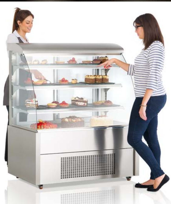
Image (above): FDC1200C Closed front assisted service display chillers

In its closed front format, the Foster Display Chiller provides a stylish solution to the demands of assisted service: showing your customers the best possible view of your food, in an ergonomically designed easy access display. Fresh is always best, and with the closed front design, your pre-prepared cakes, pastries and delicatessen can stay at their best without compromising your service times.