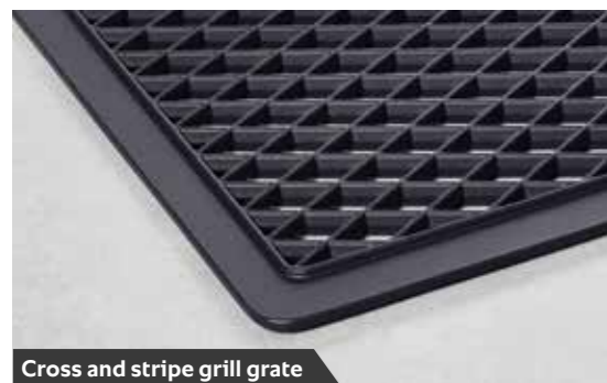
Cross and stripe grill grate

Only by using original RATIONAL accessories can you make full use of the SelfCookingCenter® XS's possibilities. They are extremely rugged and thus ideal for daily, hard use in the professional kitchen. The accessories have been designed for special cooking purposes, such as preparing pre-fried products, or grilling chickens and ducks. Even escalopes and steaks can be prepared without time consuming turning.