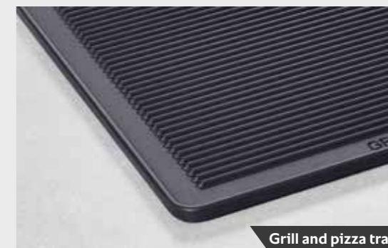
Grill and pizza tray