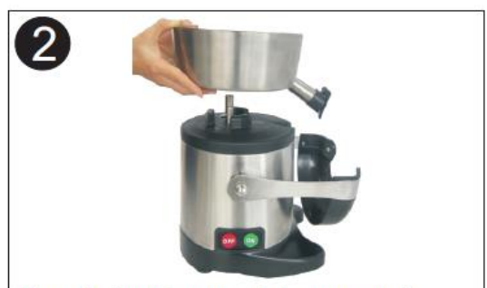
Place the bowl on top of the motor unit.

Position the pulp container and the Hopper plate.