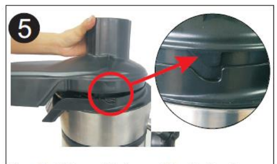
Line the lid up with the notches in the flange.