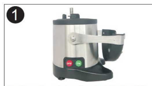
Position the motor unit so that the On/Off buttons are facing you .