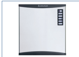
T304 Stainless Steel Panels