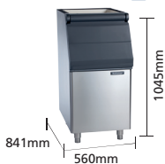
Storage Capacity: 129 kg No Bin Top needed