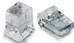
Full Cube - 12g (26.5 x 26.5 x 26 mm) Half Cube - 6g (13 x 26.5 x 26 mm)