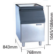
Storage Capacity: 178 kg Bin Top CBT30EMCD needed