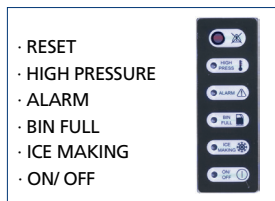
Auto-alert Indicator Lights