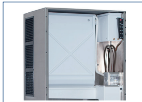
Vertical Cube System