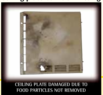
Ceiling plate burnt or missing