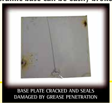
Ceramic base can be easily broken